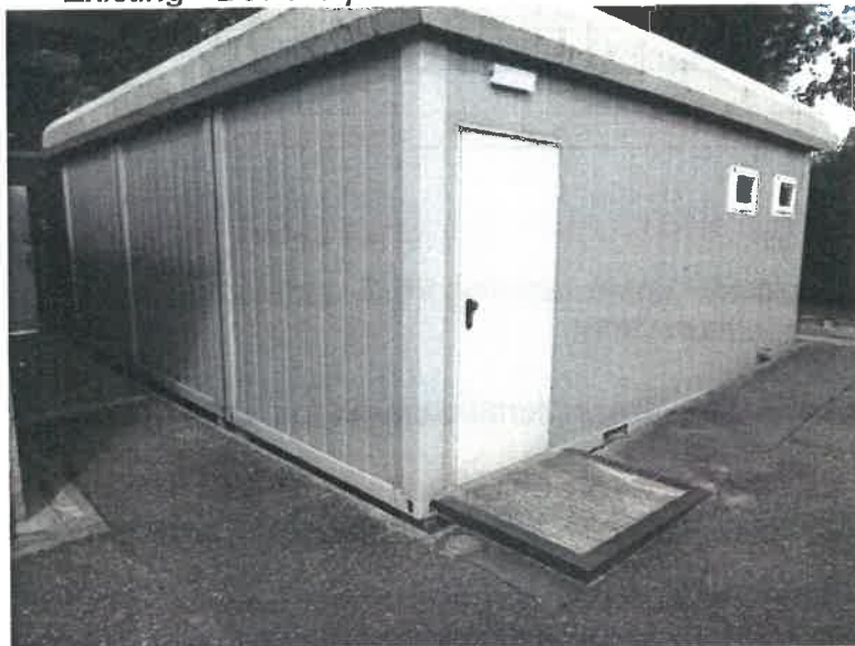
Existing - Bowthorpe Police Station Portakabins